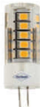
G4 3W CERAMICA